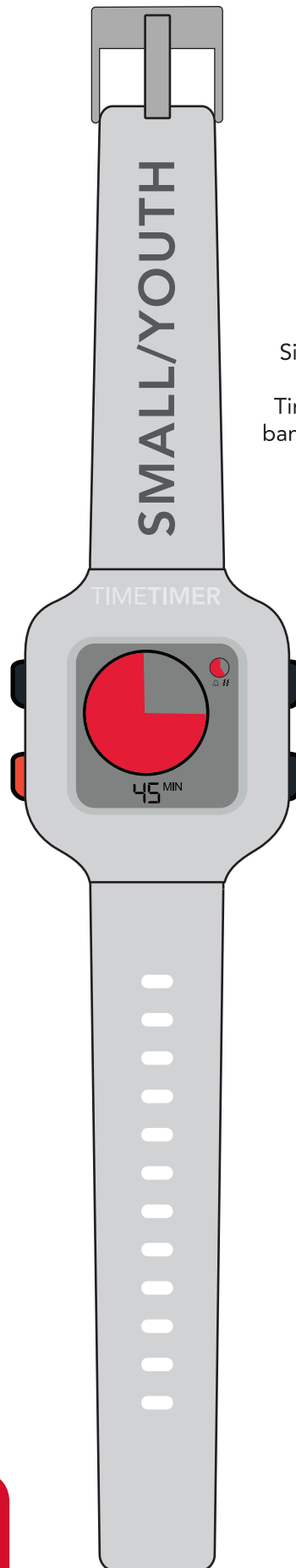
Small fits 4.75" - 7" wrist

Questions? Email us at support@timetimer.com